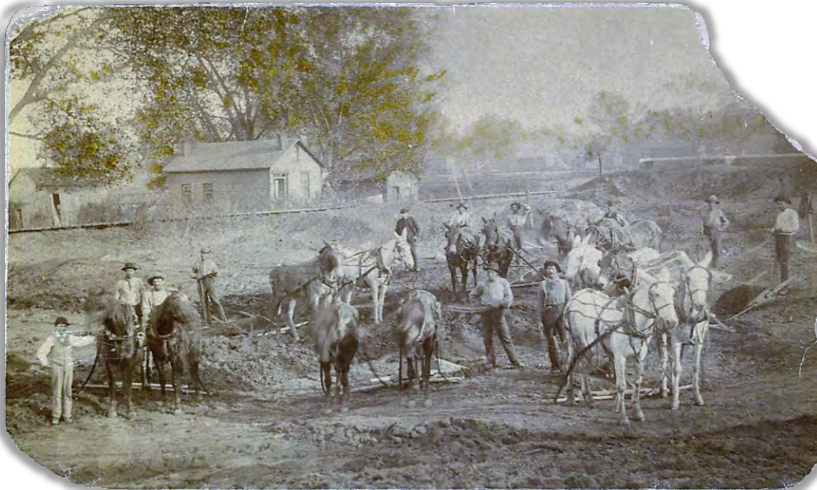
Crew working on excavation of Iowa State Capitol grounds. Des Moines, Iowa ca 1871