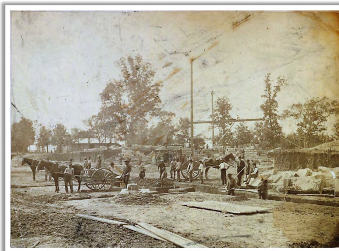
Crew laying foundation for Iowa's new State Capitol Building, Des Moines, Iowa 1871