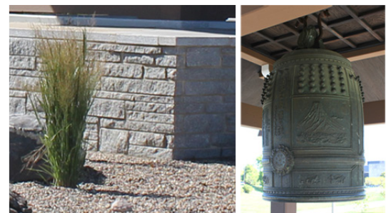
After: the bell in beautiful surroundings