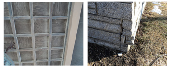
Before: faded woodwork and crumbling brick

The Iowa Hog Lift will always remain an important event in the history of our state. But the effort by DAS staff to restore this important monument, while not historical, is nevertheless deserving of credit and appreciation.