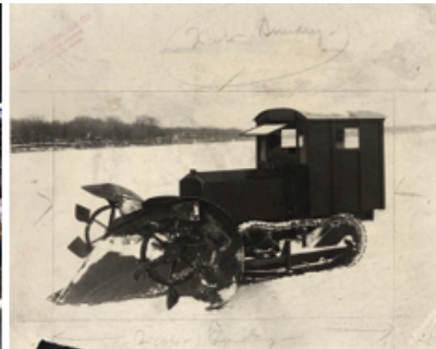
1921 Snow Plow