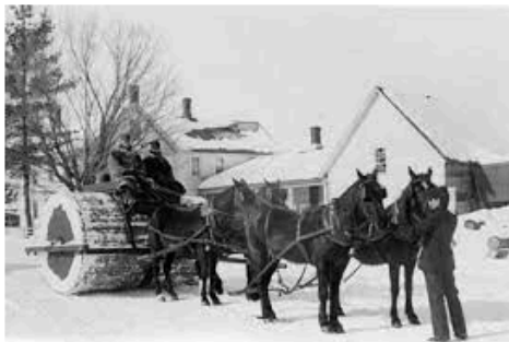
Horse-drawn Snow Plow