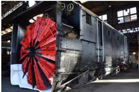
Snow Plow Train